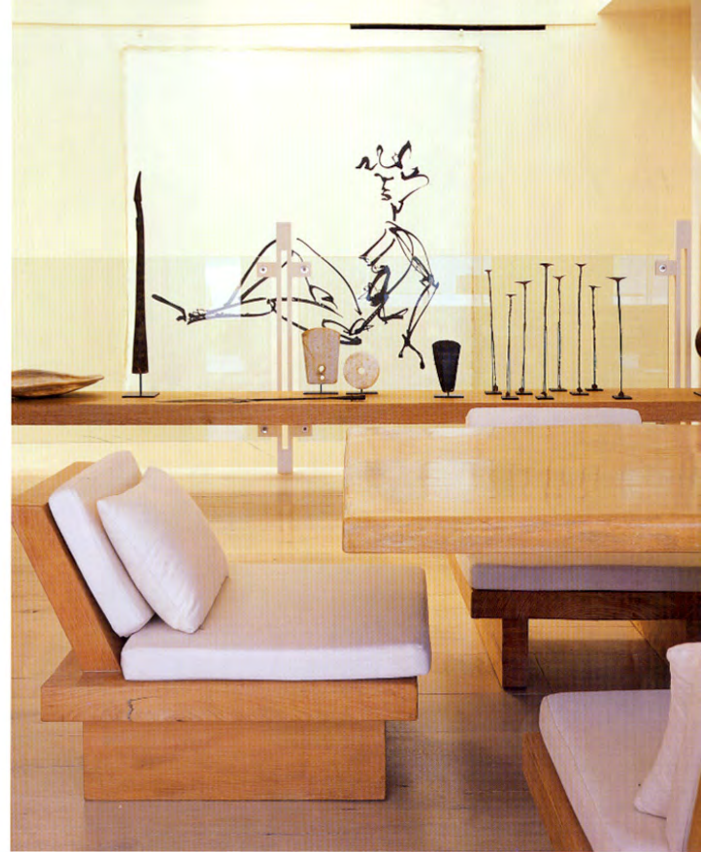
LEFT AND ABOVE: Dining area with custom furniture by Bonetti/Kozenski Studio FOLLOWING PAGES: Master bedroom